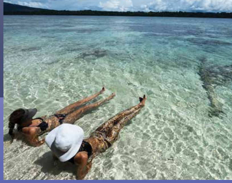
Feeling tired or just want to explore the island a little more, theres plenty to do outside of the water. Why not take a walk through the jungle to the local bat cave...

Or take a stroll around the local village and get to know some of the islanders more. Although we provide a busy schedule, we will always accomodate you to ensure you can enjoy each day however you please.